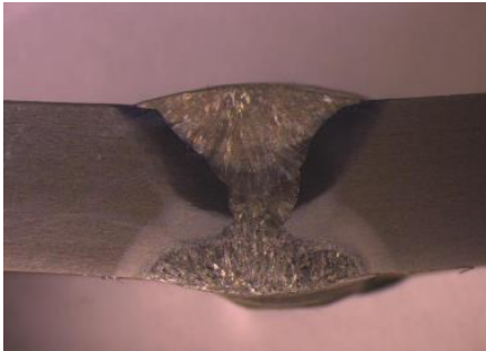
Figure.1.Macro examination of the specimen revealed complete weld fusion

From the simulation for heat flux it is observed that the heat flux generated over the bevelled region during welding is about 8.2102e5 W/m<sup>2</sup> which is denoted by the red colour on the photograph. It travelled over the whole plate from the weld region and is least at the corners of the plate which is given by blue colour and is about 9906.7 W/m<sup>2</sup>.