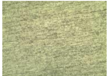
Figure.3.Micro examination of the parent region grains of ferrite with particles of alloy carbides present in the ferritic matrix