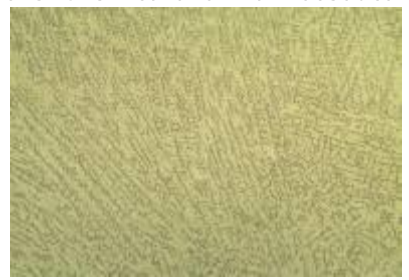
Figure.4.Micro examination of weld pool revealed dendritic delta ferrite