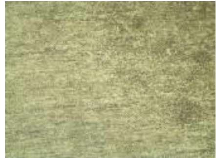
Figure.2.Micro examination of the parent region revealed grains of ferrite with particles of alloy carbides present in the ferritic matrix